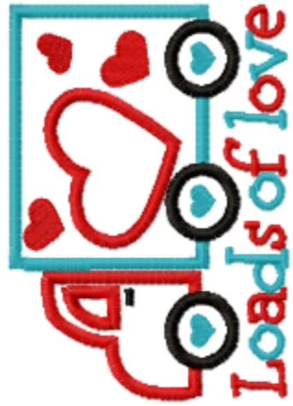
Name: Loadsoflovei2s 5 File: LoadsOfLoveI2S 5_5in.pes Stitches: 14230 Size: 3.93x5.54 " Colors: 5/15 Stops: 14