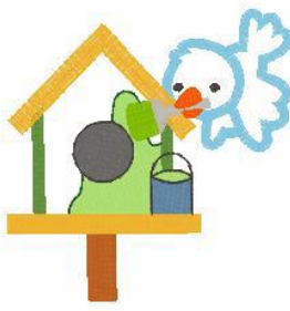
File: DBJJ300-7-5X7.ART Stitches: 9154 Size: 124.8 x 128.0 mm