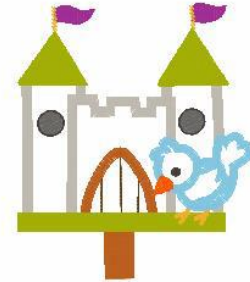
File: DBJJ300-4-5X7.ART Stitches: 11976 Size: 123.3 x 144.5 mm