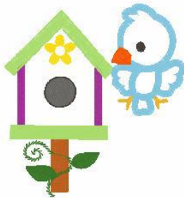
File: DBJJ300-1-5X7.ART Stitches: 8478 Size: 124.1 x 132.0 mm