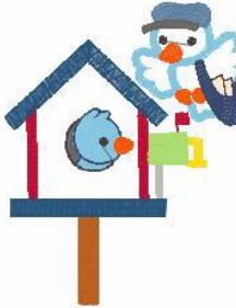
File: DBJJ300-8-5X7.ART Stitches: 7975 Size: 108.9 x 135.7 mm