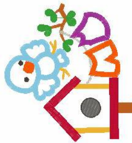
File: DBJJ300-2-5X7.ART Stitches: 8227 Size: 125.0 x 131.5 mm