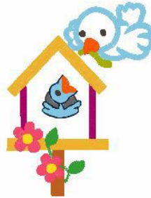
File: DBJJ300-5-5X7.ART Stitches: 10468 Size: 119.7 x 157.2 mm