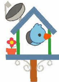
File: DBJJ300-3-5X7.ART Stitches: 10246 Size: 102.9 x 149.0 mm